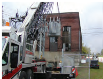
Rigging a new GSU transformer

One project manager should be responsible for coordinating all activity onsite to ensure that each group (mechanical, electrical, civil) has the time and access required to efficiently perform their scope of work.