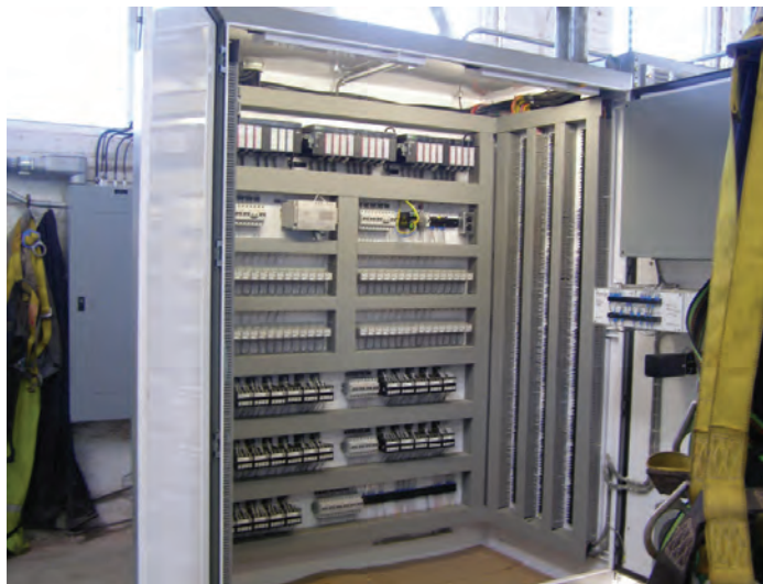
PLC panel for small hydro

The final step is to perform system commissioning, to verify that all system components are wired correctly, that field devices are working as desired, and that all PLC/HMI programming is correct. Detailed point-to-point wiring checks from the field devices back to the PLC, HMI, and (if appropriate) SCADA should be performed in a controlled and methodical fashion. This “end-to-end” test proves that the individual components are working correctly and that the system as a whole is performing as expected.