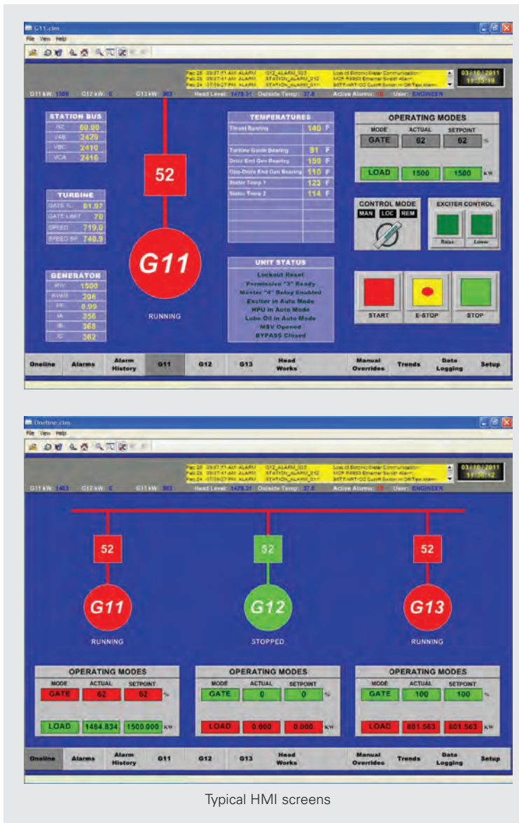
Typical HMI screens

Regulators were calling for the installation of large and expensive valves at a small hydro station in northern Vermont, to provide bypass flow around the station after a utility trip. Due to the location of the plant and the nature of the interconnection, this facility was often knocked offline due to line conditions. As an alternative to bypass valves, the plant implemented a solution that in effect used the turbines as valves to provide the necessary bypass flow after a trip. Basically after an electrical trip, generators were automatically brought to "Speed No Load" and were held there pending further commands. This allowed the plant to quickly restore downstream flow even if the units could not be brought back online. With the line fault condition cleared, the units could quickly be placed back online to start production.