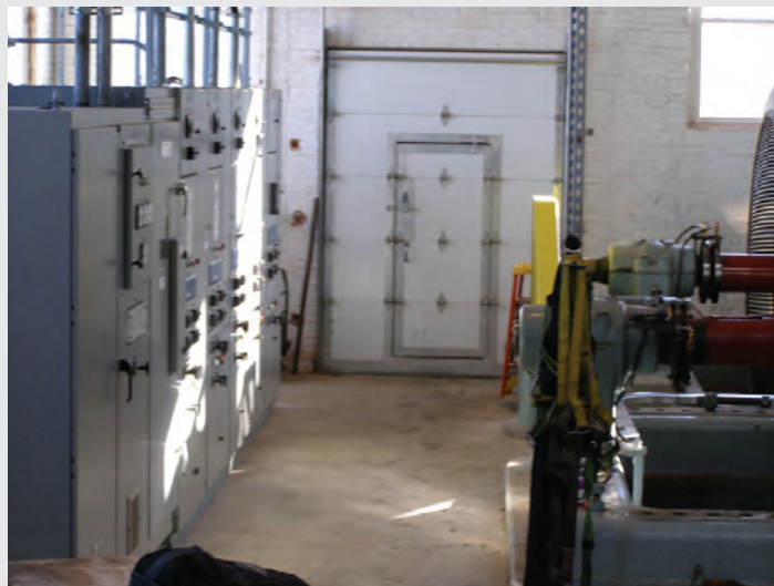
Example of a repowered small hydro using front-access medium voltage switchgear before and after