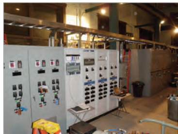
Typical small hydro upgrade, protection, and controls

For synchronous machines, synchronism check relays should be applied and an auto synchronizer is recommended. The sync-check relay should supervise the generator breaker closing for either manual or automatic synchronizing. Motor starters or contactors should not be used in synchronous machine applications.